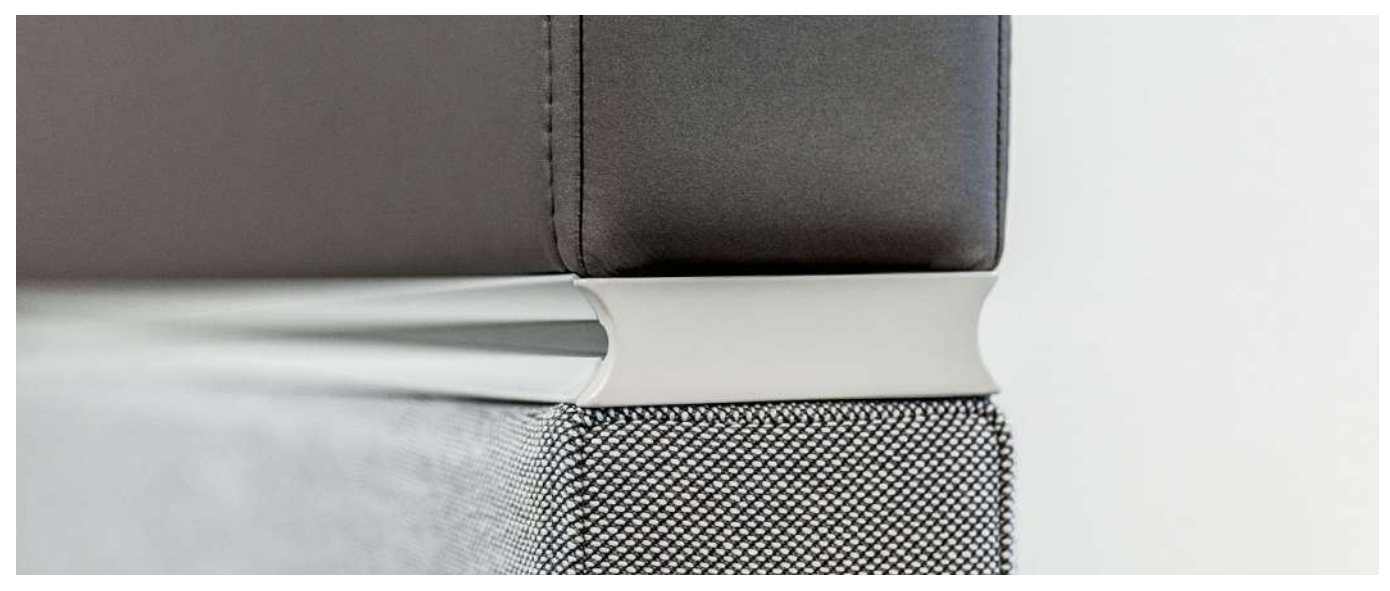
Natura or white workrails