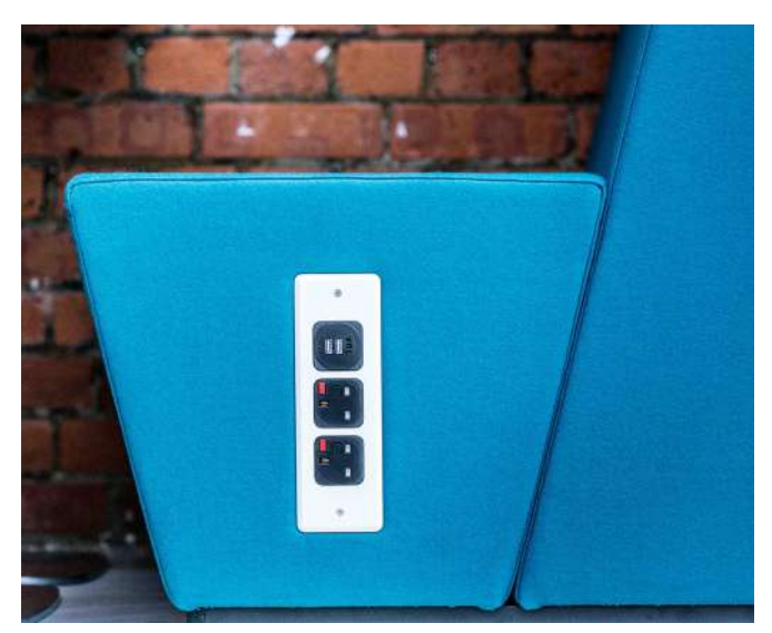
Integrated power options