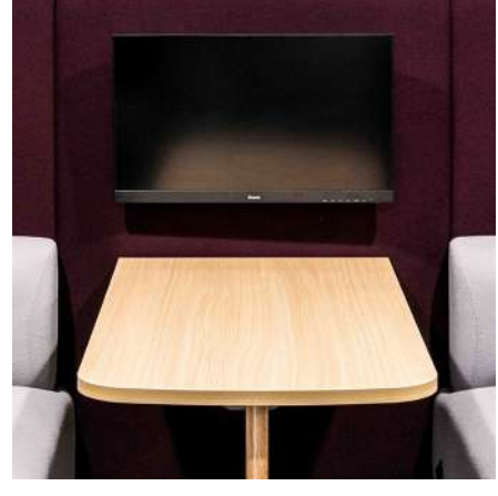
Integrated work surfaces