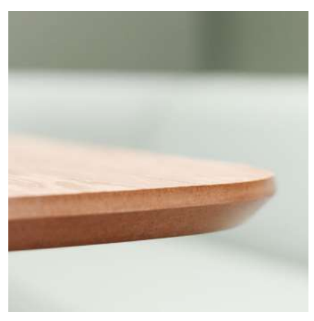
Chamfered edge tables