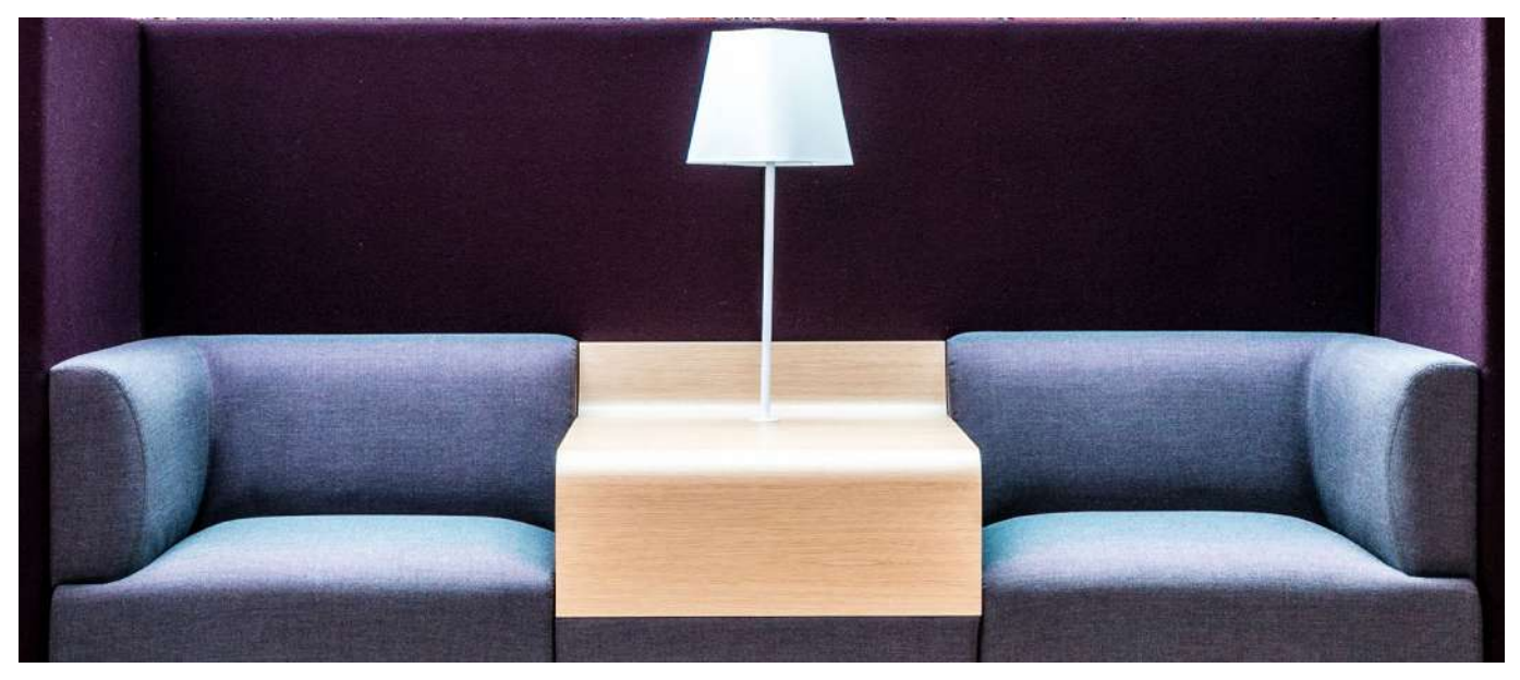
Oak or white console finishes Integral lamp