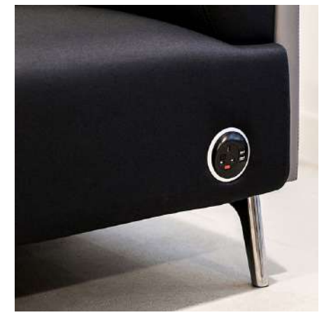
Black or polished aluminium legs