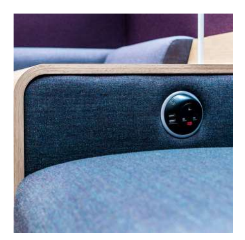
Integrated power options