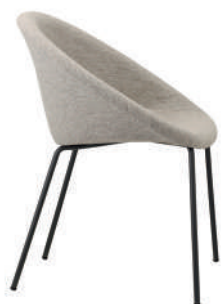
2685 VA T6 28

Poltrona con scocca imbottita e anima in tecnopolimero. Struttura a 4 gambe in acciaio tubolare \varnothing mm 16 verniciato antracite. Giulia Pop è adatta a tutti gli ambienti dalla casa al contract. Rivestimento in tessuto non sfoderabile. Per uso interno.