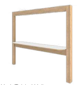
Work Table Wall