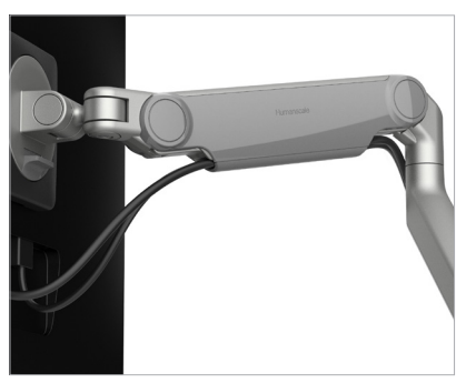
Rubberised Cable Management