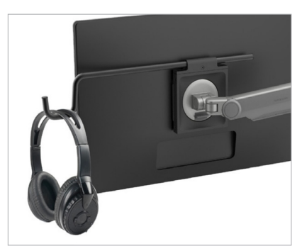
Accessory Holder (optional)