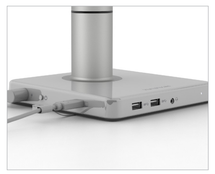
M/Connect 2 Docking Station